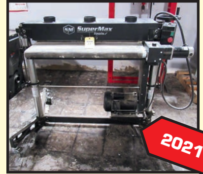
SUPERMAX 37"W. X 2"THK., DUAL DRUM SANDER

NISSAN 5,000-LB. BASE CAP. MDL. PJ02A25V , LPG, 3-stage mast, 187" max. lift ht., solid tires, 4,524 hours.