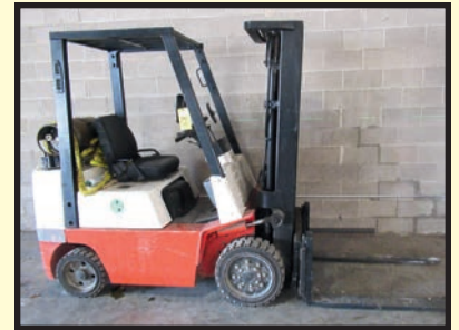
NISSAN 5,000-LB. CAP. LPG FORKLIFT