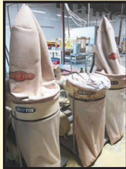
SAMPLE VIEW OF SHOP FOX DUST COLLECTORS

WEDNESDAY, AUGUST 2 • 10:00 A.M. LIVE ONLINE WEBCAST ONLY (NO ONSITE BIDDING)