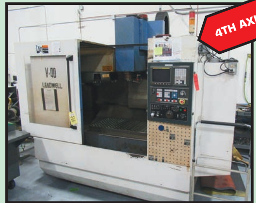
LEADWELL V-40 VERTICAL MACHINING CENTER

4' X 9" CINCINNATI BICKFORD, S/N 1661R2314.