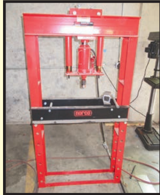
NORCO MDL. 78022 SHOP PRESS