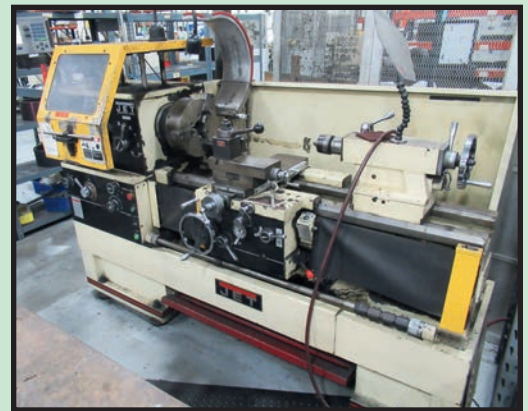
JET 18" X 40" GAP BED ENGINE LATHE