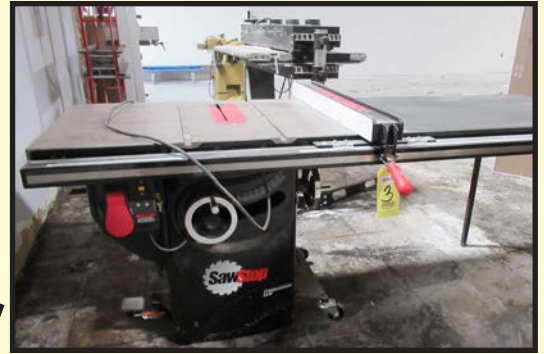
SAWSTOP PROFESSIONAL TABLE SAW