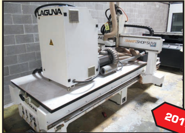
LAGUNA SMARTSHOP 2 SUV CNC 3-AXIS ROUTER