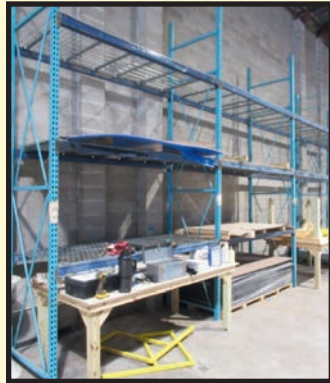
ADJUSTABLE PALLET RACKING