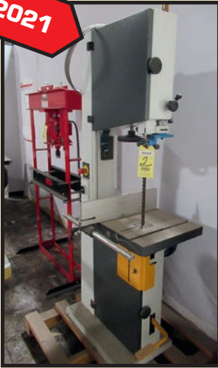
LAGUNA LT16HD VERTICAL BANDSAW