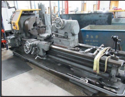
LODGE & SHIPLEY 32" X 84" ENGINE LATHE

INSPECTION BY APPOINTMENT ONLY: Email Daniel.jones@cpi-howden.com