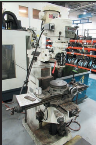
BRIDGEPORT 9" X 42" SERIES I VERTICAL MILL