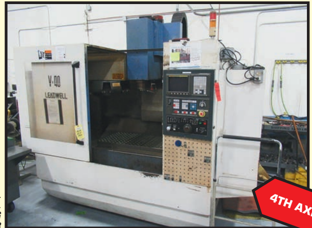
LEADWELL V-40 VERTICAL MACHINING CENTER