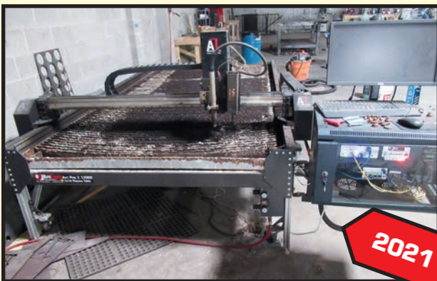
ARCLIGHT DYNAMICS MDL. ARC PRO 12000 PLASMA TABLE AND ENGRAVER