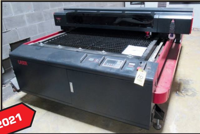
BOSS LASER HP5598 LASER CUTTER AND ENGRAVER

SHORT NOTICE LIVE WEBCAST AUCTION (3) HOUSTON & STAFFORD, TEXAS LOCATIONS METALWORKING & WOODWORKING EQUIPMENT NEW AS 2021