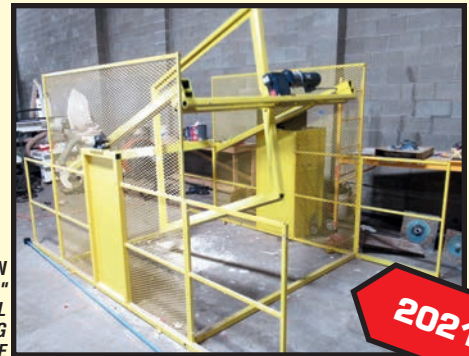
MANNETRON 72" X 72" ROTATIONAL CASTING MACHINE

Read Partial Terms and Conditions on Page 3 of Brochure