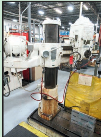
CINCINNATI BICKFORD 4' X 9" RADIAL ARM DRILL

LIVE ONLINE WEBCAST ONLY (NO ONSITE BIDDING)