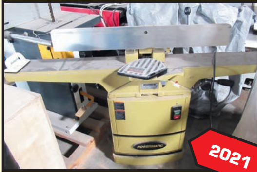
POWERMATIC MDL. 54HH JOINTER