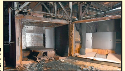
WHEELABRATOR SUPER 72" "TUMBLAST" SHOTBLASTING MACHINE