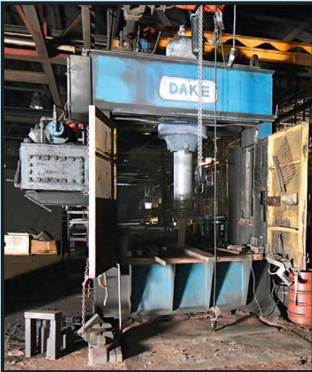
STRAIGHTENING PRESS DAKE 300 T. CAP. HYDRAULIC STRAIGHTENING PRESS.