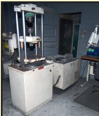
TINIUS OLSEN TENSILE TESTER