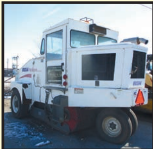
ELGIN MDL. PELICAN SERIES SE STREET SWEEPER

INSPECTION: Monday, May 6 & Tuesday, May 7, 9:00 A.M. to 4:00 P.M.