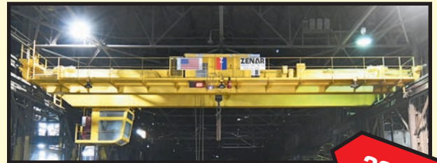
ZENAR 63' SPAN 20/10 T. CLASS E HOT METAL CRANE