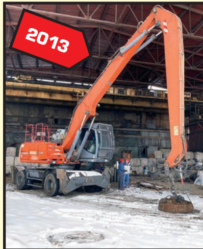
ATLAS MDL. 300MH MATERIAL HANDLER