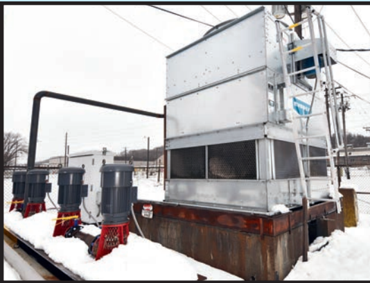
COOLING CIRCUIT EQUIPMENT EVAPCO COOLING TOWER MDL. AT19-2H8, qty. of (4) 7-1/2 HP vertical pumps, butterfly valves, S/N 21P118711; EVAPCO COOLING TOWER MDL. AT-243, 2,400 gal. per minute; TRANE 300 T. CHILLER SYSTEM.