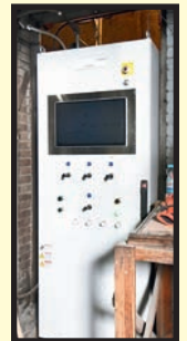
TENOVA ARC FURNACE CONTROL