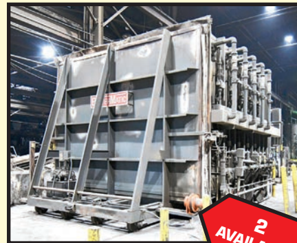
BEAVERMATIC 12'W. X 12'L. X 8'H. GAS FIRED CAR BOTTOM FURNACE