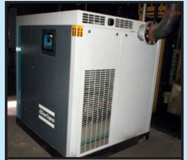
AIR COMPRESSOR SYSTEMS (3) SULLAIR 200 HP WATER COOLED ROTARY SCREW AIR COMPRESSORS (two units recently rebuilt); ATLAS COPCO MDL. FD-1750 REFRIGERATED AIR DRYER, new 2019, 1,750 CFM cap.