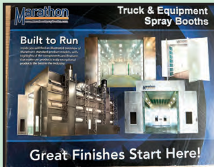
MARATHON PRESSURIZED SIDE DOWN DRAFT SPRAY BOOTH