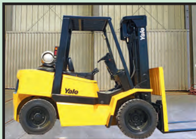
YALE 8,000-LB. BASE CAP. LPG FORKLIFT