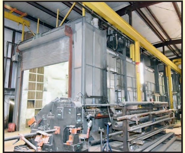
JBI 12' X 12' X 60' COMBINED CYCLE PAINT BOOTH

FOLDING PLASTIC TBLS.; LARGE QTY. SWIVEL EXECUTIVE CHAIRS; METAL AND FORMICA DESKS; SHELF UNITS; FILING CABINETS; LARGE QTY. 3-DRAWER FILING CABINETS; LARGE QTY. OFFICE SUPPLIES; METAL AND GLASS RECEPTION DESK; LARGE CONFERENCE TBL. W/SWIVEL CHAIRS.