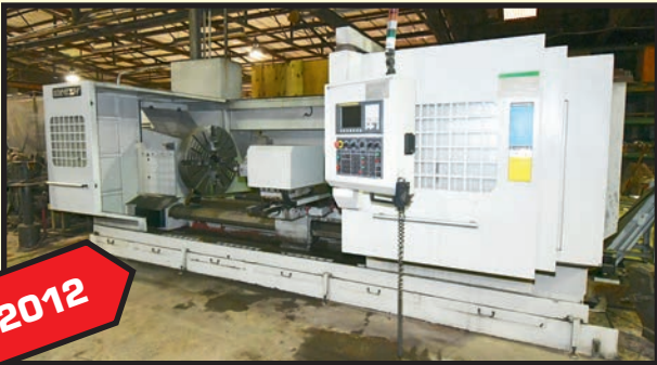
GANESH 40" X 120" FLATBED CNC LATHE