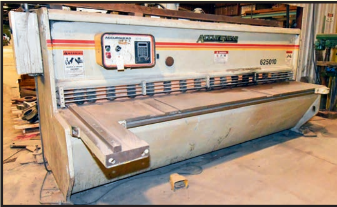
ACCUR SHEAR 10' X 1/4" HYDRAULIC SHEAR