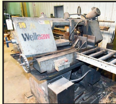
WELLSAW MITERING HORIZONTAL BANDSAW