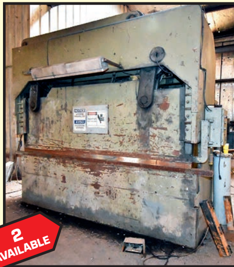
HTC 10' X 14 GA. HYDRO-MECHANICAL PRESS BRAKE