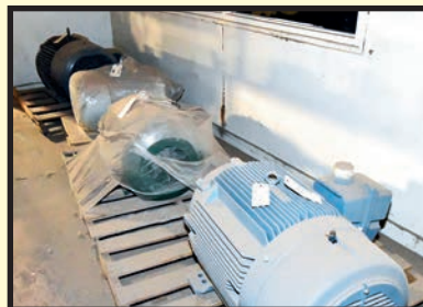
NEW MOTORS UP TO 100 HP

DAY 2: THURS., DEC. 14 TIMED ONLINE AUCTION BIDS START CLOSING AT 10:00 A.M. CST