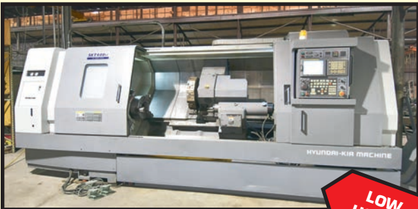
HYUNDAI KIA MDL. SKT400LC LONG BED CNC LATHE