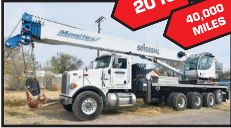
MANITEX/PETERBILT 50 T. TRUCK CRANE

LATE MODEL CNC & MANUAL MACHINE TOOLS; WIDE ARRAY OF FABRICATING & WELDING MACHINES; 2015 PETERBILT MANITEX 50 T. CRANE TRUCK; FLATBED TRUCKS; TRAILERS; TELEHANDLERS; HUGE QUANTITY OF NEW MILL PARTS; RAW MATERIAL; STEEL SCRAP; MUCH MORE!