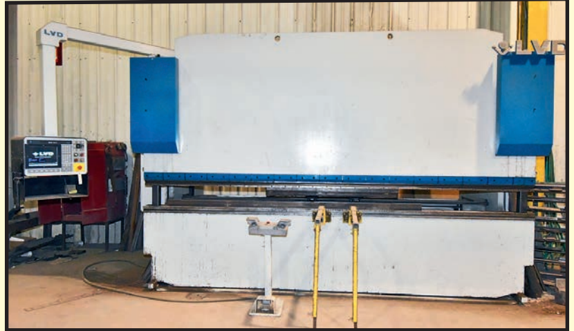
LVD 200 T. X 13' CNC PRESS BRAKE