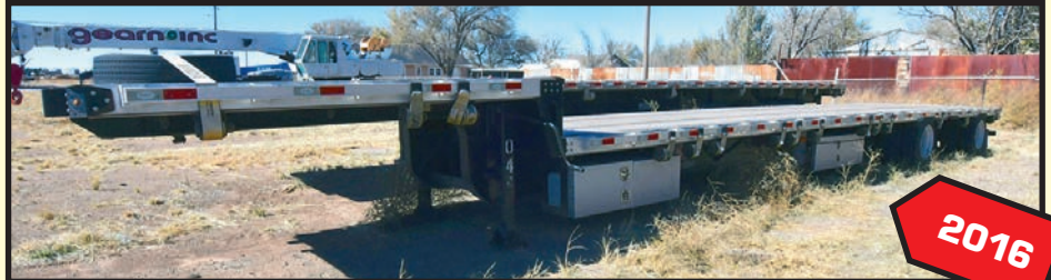
DORSEY 40' LOWER DECK STEP-DECK TRAILER

FOR BIDDING DAY 1. Go to www.pmi-auction.com and click on BidSpotter or proxibid on our calendar page for this auction sale. DAY 2 Bidspotter Only.