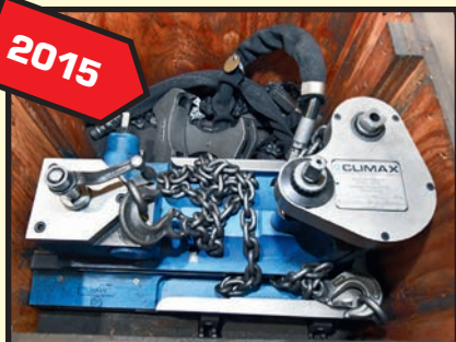
CLIMAX PORTABLE KEYWAY MILL