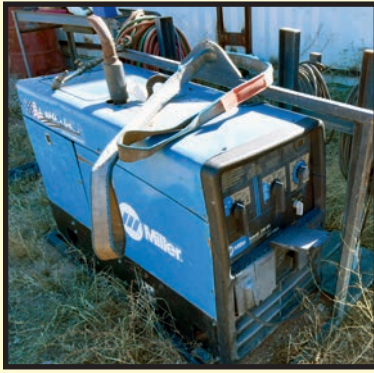
MILLER BOBCAT 250 EFI PORTABLE WELDER