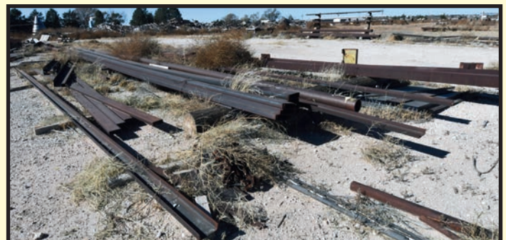
CARBON STEEL STRUCTURAL MATERIAL

HUGE SCRAP OPPORTUNITY CONSISTING OF VARIOUS DISASSEMBLED PELLET AND FLAKING MILLS; GRAIN BINS; STRUCTURAL STEEL; INOPERABLE MACHINERY.