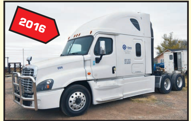
FREIGHTLINER CASCADIA 125 SLEEPER CAB TRUCK

(16) SKF EXPLORER MDL. 22300CC/C3W33 BEARINGS, new in crates; APPROX. (60) NEW SKF HIGH PRECISION ROLLER BEARINGS (still in wrapping); GRUNDFOS PUMP UNIT, in box; LARGE SELECTION OF NEW AND REBUILT ELECTRIC MOTORS UP TO 100 HP; (2) NEW BALDOR 100 HP MOTORS IN CRATES; (2) NEW 15 HP MOTOR IN CRATE; ROLL FEEDER PARTS; HUGE QUANTITY OF CASTINGS FOR FERRELL ROSS ROLLS INCL. THIN BASES, THIN AND PIVOT HOLDERS, COVER PLATES, FLAME CUT SPROCKETS, BEARING BRACKET BASES; (8) FLOMASTER FINISHED HYDRAULIC RESERVOIRS; AUGER SCREWS, HUGE ASSORTMENT OF BLOWPIPES; VENTING MATERIAL; FINISHED VENTS; VALVES; SHOOTS; OTHER STRUCTURAL COMPONENTS FOR FEED MILLS; MOTOR BRACKETS; ATTACHMENT HARDWARE; HYDRAULIC CYLINDERS; FILTER SCREENS; ADJUSTABLE MOTOR BASES; COG BELT PULLEYS; SHEAVES; SCRAPER BLADES; GEARS; HUGE ASSORTMENT OF SMALL COMPONENT PARTS FOR FERRELL MILLS INCL. FASTNERS OF ALL SIZES AND DESCRIPTIONS; WASHERS; NUTS; BOLTS; HEXHEAD BOLTS; CAP SCREWS; LOCK NUTS W/ LOCK NUT RETAINERS; TENSION SPRINGS; WORM GEARS; BEARING PINS; THREADED RODS; RACK GEARS; THERMOMETERS; FILTER REGULATORS; PNEUMATIC FITTINGS; SHAFT SEALS; CLAMPS; DOZENS OF CORRUGATED MILL ROLLS OF VARIOUS DIMENSIONS.