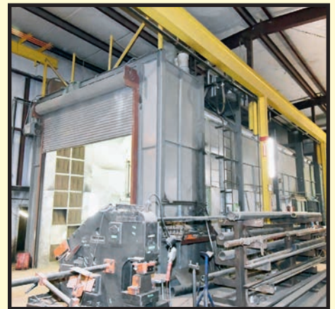
JBI 12' X 12' X 60' COMBINED CYCLE PAINT BOOTH

Read Partial Terms & Conditions on Page 8