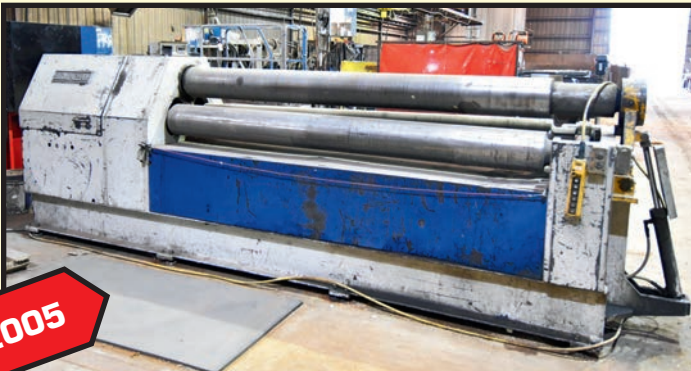
BIRMINGHAM 8' X 1/4" HYDRAULIC DOUBLE PINCH PLATE ROLL