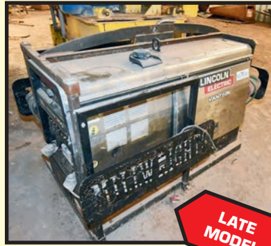
LINCOLN VANTAGE PORTABLE DIESEL WELDER