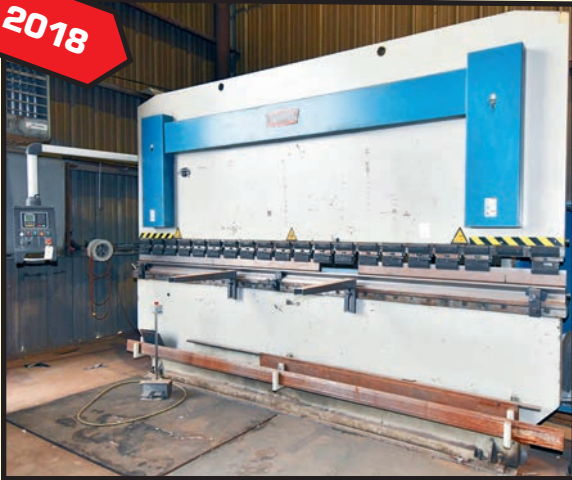
BAILEIGH 220 T. X 13' CNC PRESS BRAKE