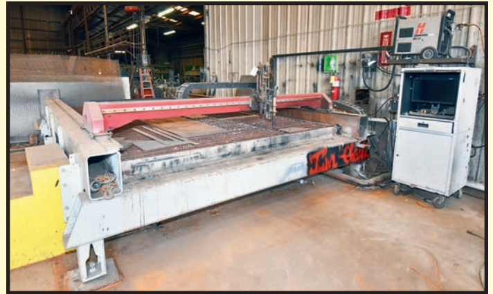
TORCHMATE 9'W. X 16"L. CAP. CNC PLASMA/OXY-FUEL CUTTING MACHINE