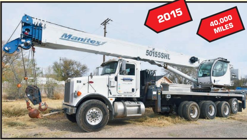
MANITEX/PETERBILT 50 T. TRUCK CRANE