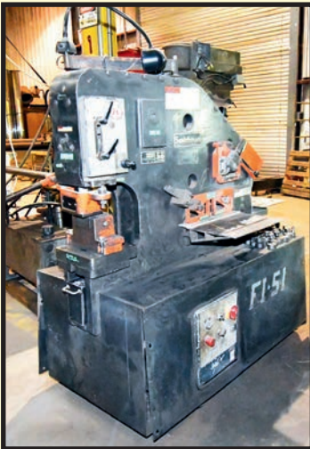
SCOTCHMAN FI-51 HYDRAULIC IRONWORKER

SNAP-ON MDL. MM250SL , 200 amp, 240 v., 60 % duty cycle w/built in wire feeder, S/N MM250SL-39814.