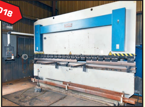
BAILEIGH 220 T. X 13' CNC PRESS BRAKE