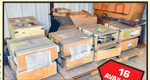
NEW SKF PRECISION ROLLER BEARINGS IN CRATES