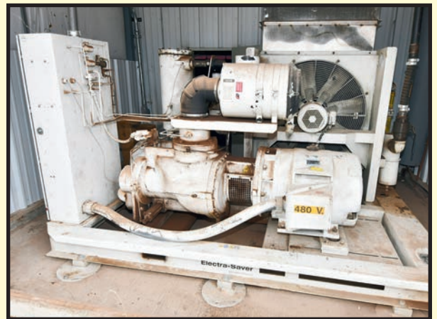
GARDNER DENVER 150 HP ROTARY SCREW AIR COMPRESSOR