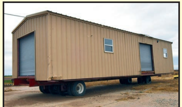
PORTABLE STEEL BUILDING