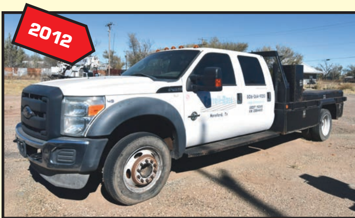
FORD F-450 FLATBED CREW CAB DIESEL TRUCK