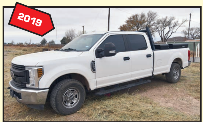
FORD F-250 XL CREW CAB PICKUP TRUCK

FOR BIDDING DAY 1. Go to www.pmi-auction.com and click on BidSpotter or proxibid on our calendar page for this auction sale. DAY 2 Bidspotter Only.