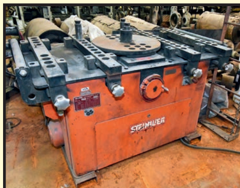
STEINWEG REBAR BENDING MACHINE