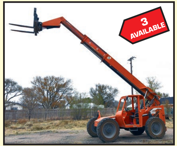
JLG MDL 6042 TELEHANDLER STYLE FORKLIFT