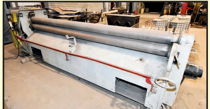
NIAGARA 10' X 12 GA. INITIAL PINCH BENDING ROLL