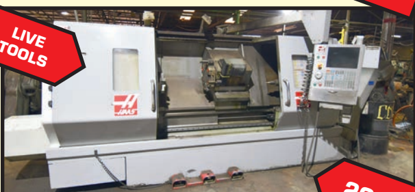
HAAS MDL. SL30-L LONG BED CNC LATHE