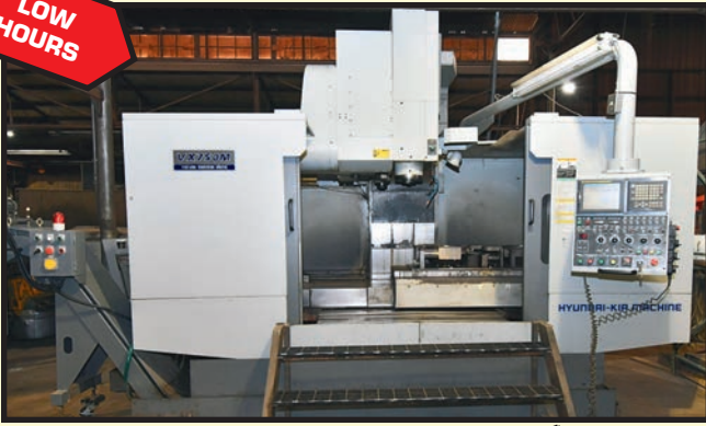
HYUNDAI KIA MDL. VX750M VERTICAL MACHINING CENTER

FOR BIDDING AT THIS AUCTION. Go to www.pmi-auction.com and click on BidSpotter or proxibid on our calendar page for this auction sale.