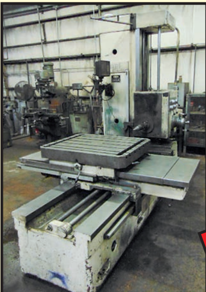
WOTAN/SACEM TABLE TYPE HORIZONTAL BORING MILL

STEINWEG MDL. B50ST, new 1985, will bend up to 2" material in single bend, 6,500 PSI, single bar, (4) 1-1/8" bars at a time, w/assorted tooling, S/N 8666.