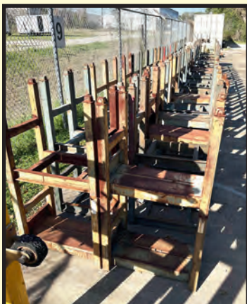
STACKABLE METAL PIPE RACKS

FULTON MDL. FT-0240-C, gas fired, 2.4 million BTU/HR, 150 GPM thermal fluid at 650 deg. F, Fulton FT-200L combination tank, high pressure pump, Fulton control panel.