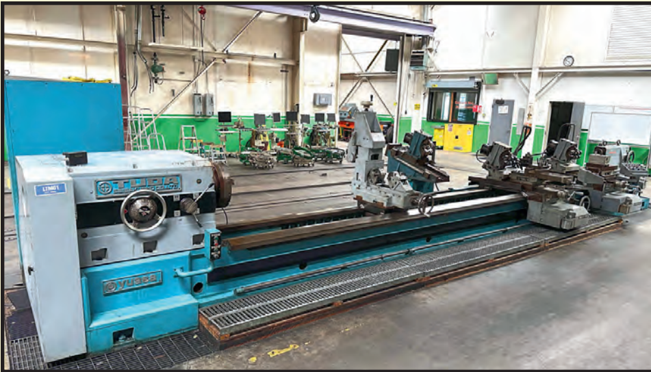
TUDA 39" X 318" MANUAL FLATBED LATHE