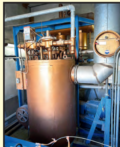
FULTON MDL. FT-0240-C THERMAL FLUID HEATER

WEDNESDAY, APRIL 9 10:00 A.M. CDT LIVE ONSITE W/WEBCAST