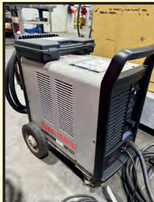
HYPER THERM POWER MAX 1000 G3 SERIES WELDER