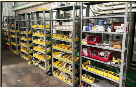
SAMPLE VIEW OF ELECTRICAL COMPONENTS

ELECTRICAL COMPONENTS; HARDWARE; SPOOLS OF WIRE; ELECTRIC MOTORS; CONTACTORS; SWITCH GEAR; FLORESCENT LIGHT FIXTURES; METAL HAYLIDE LIGHT FIXTURES; AND MORE- SEE CATALOG FOR DETAILS.