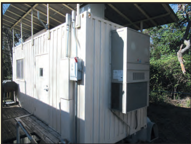
PORTABLE CUSTOM KITCHEN

WEDNESDAY, APRIL 9 10:00 A.M. CDT LIVE ONSITE W/WEBCAST