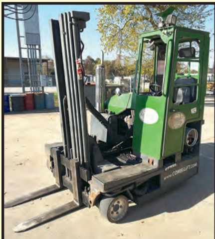
COMBILIFT 5,000-LB. BASE CAP. FORKLIFT