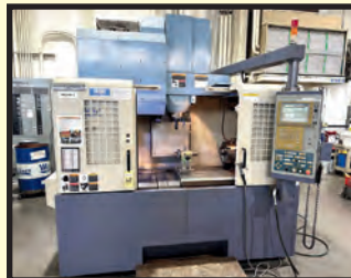
OKK MDL. VM5-2 4-AXIS VERTICAL MACHINING CENTER