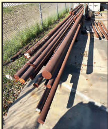
SAMPLE VIEW OF ASSORTED ROUND BAR STOCK