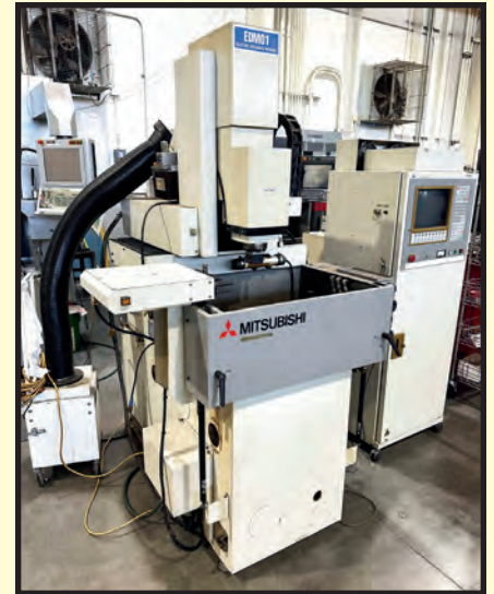
MITSUBISHI MDL. EX8 RAM TYPE EDM MACHINE