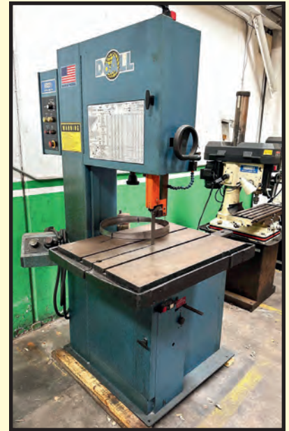
DOALL MDL. 2012-VH VERTICAL BANDSAW