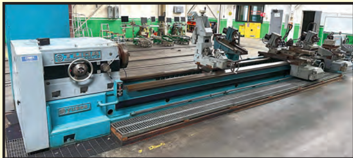
TUDA 39" X 318" MANUAL FLATBED LATHE