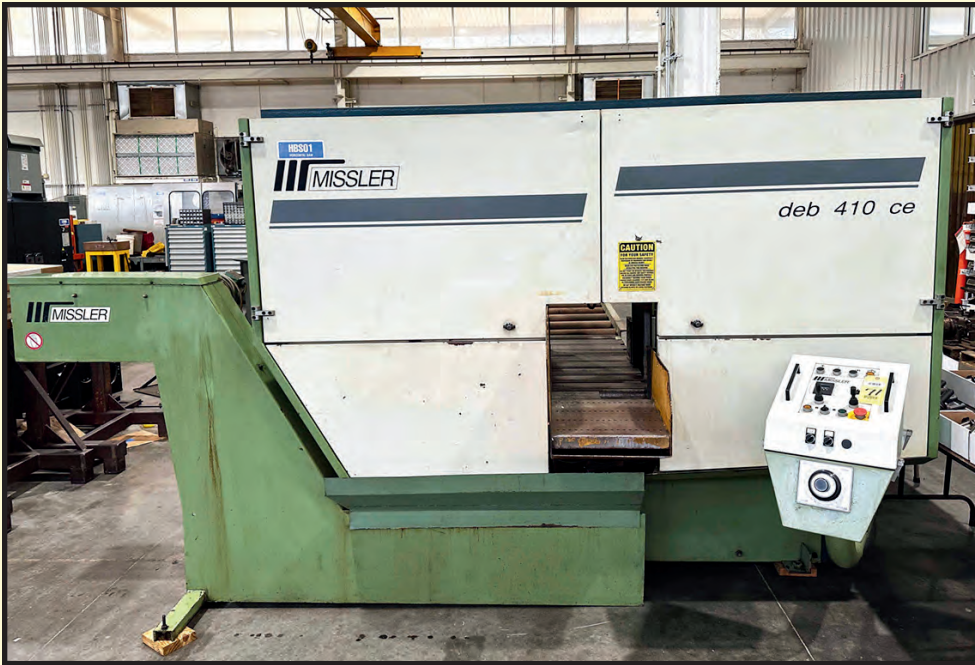
MISSLER MDL. DEB410CE AUTOMATIC HORIZONTAL BANDSAW