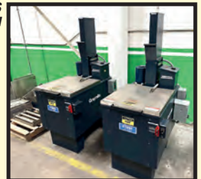
GREY MILLS PARTS WASHER SYSTEM

WEDNESDAY, APRIL 9 10:00 A.M. CDT LIVE ONSITE W/WEBCAST