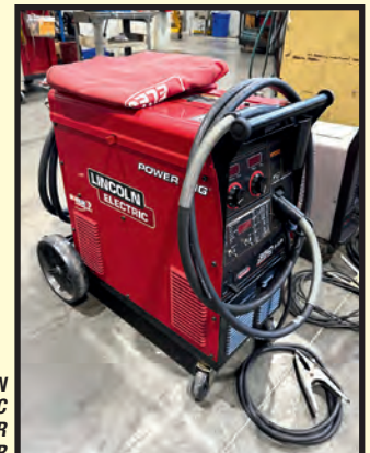
LINCOLN ELECTRIC 350MP POWER MIG WELDER