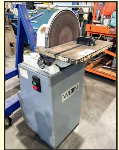
WILTON MDL. 4401A DISC GRINDER

GAE-BRO 410-R 2,600-LB. CONCRETE BUCKET; WILTON MDL. 4401A DISC GRINDER; 36" BLAST CABINET AND DUST COLLECTION SYSTEM; HUSKY CONCRETE MIXER; SEARS CRAFTSMAN BANDSAW; CUTOFF SAW; VERTICAL BANDSAW; DELTA SHOP MASTER; (4) PALLET JACKS; SHOP FANS; RIDGID CHAIN VISES; POWER TOOLS; WILTON VISES; HAND TOOLS; ASSTD. BANDSAW BLADES; HEATERS; 4-STATION ULTRASONIC TANK; HOTSY HEATED PRESSURE WASHER; VACUUM PUMPS; CHAIN SAW; HEDGE TRIMER; WEED-EATER; JOHN DEERE MDL. STX38 RIDING LAWN-MOWER; FORMAN'S DESKS; ROLLER CARTS; STEP LADDERS; PORTABLE COMPUTER CARTS; OFFICE FURNITURE- DESKS, CHAIRS, CUBICLES, 3,000 GALLON LIQUID TANK; MORE.