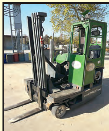
COMBILIFT 5,000-LB. BASE CAP. FORKLIFT

Monday & Tuesday, April 7 & April 8, 9:00 A.M. to 4:00 P.M. Each Day