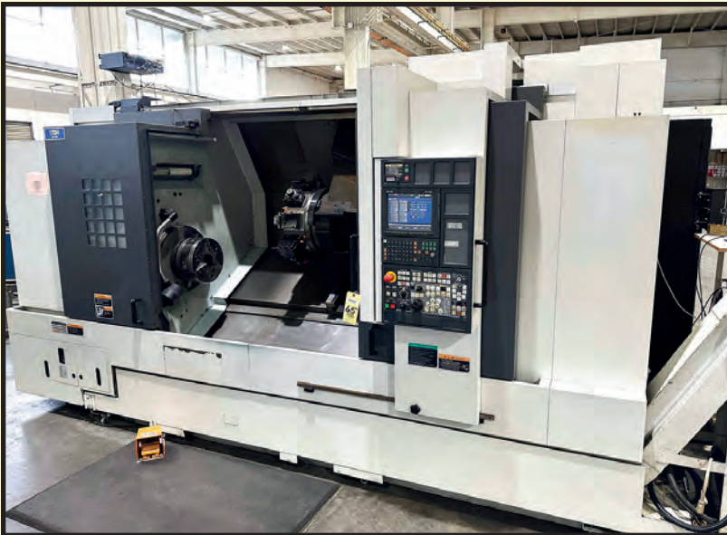
MORI SEIKI MDL. NL3000Y/1250 CNC MULTI-TASKING LATHE