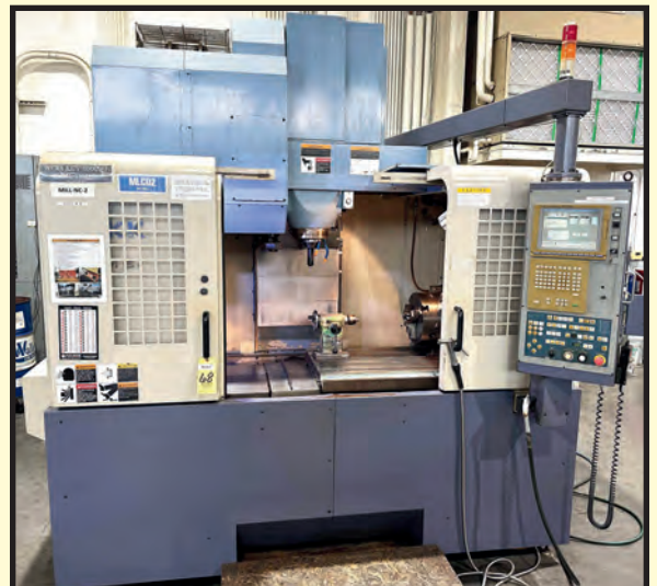
OKK MDL. VM5-2 4-AXIS VERTICAL MACHINING CENTER

YOU MUST REGISTER IN ADVANCE FOR ONLINE BIDDING AT THIS AUCTION. Go to www.pmi-auction.com and click on BidSpotter or proxibid on our calendar page for this auction sale.