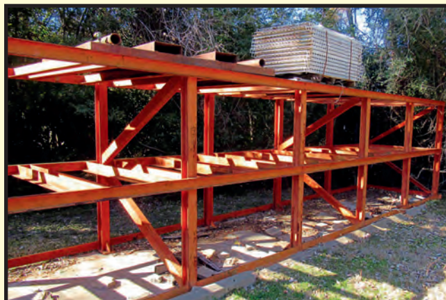
55-GALLON DRUM RACK