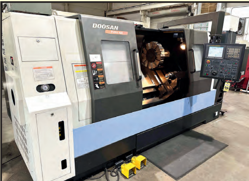
DOOSAN PUMA MDL. 400B CNC LATHE