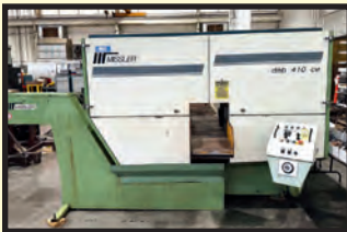
MISSLER MDL. DEB410CE AUTOMATIC HORIZONTAL BANDSAW