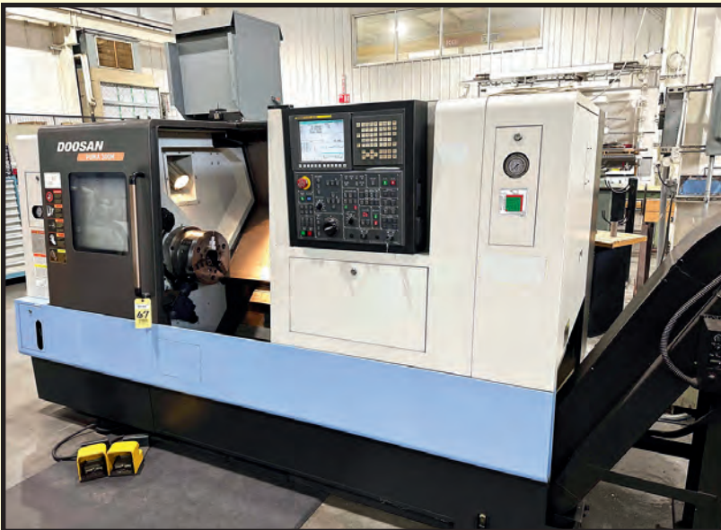
DOOSAN PUMA MDL. 300MC CNC MULTI-TASKING LATHE