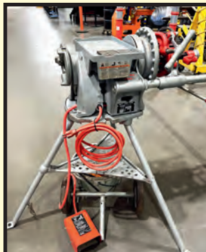
RIDGID MDL. 300-12 PIPE THREADER