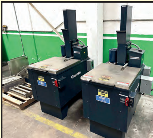
GREY MILLS PARTS WASHER SYSTEM