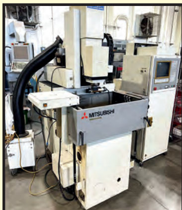
MITSUBISHI MDL. EX8 RAM TYPE EDM MACHINE