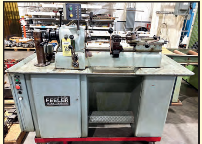
FEELER MDL. FSM-59 SECOND OPERATION LATHE

Monday & Tuesday, April 7 & April 8, 9:00 A.M. to 4:00 P.M. Each Day