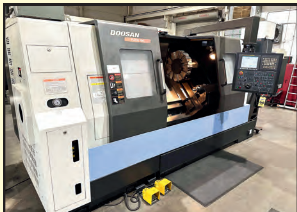
DOOSAN PUMA MDL. 400B CNC LATHE

Featuring: Machine Tools; Tooling & Accessories; Material Handling Equipment; Shop Tools; Plant Support Equip.; Raw Material; MRO Supplies; Office Equip.; Portable Custom Kitchen; More