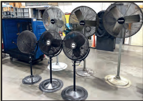
SAMPLE VIEW OF SHOP FANS