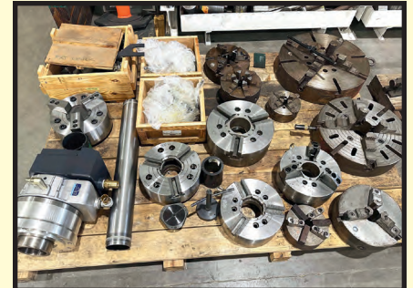
SAMPLE VIEW OF PRECISION MACHINE ACCESSORIES