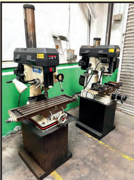
CNC MASTERS CNC TABLETOP MILLING MACHINE AND JET MILLING/DRILLING MACHINE

CNC MASTERS MDL. CNCJR, 19" X, 7" Y, 13.5" Z-axis travels, S/N 106977.