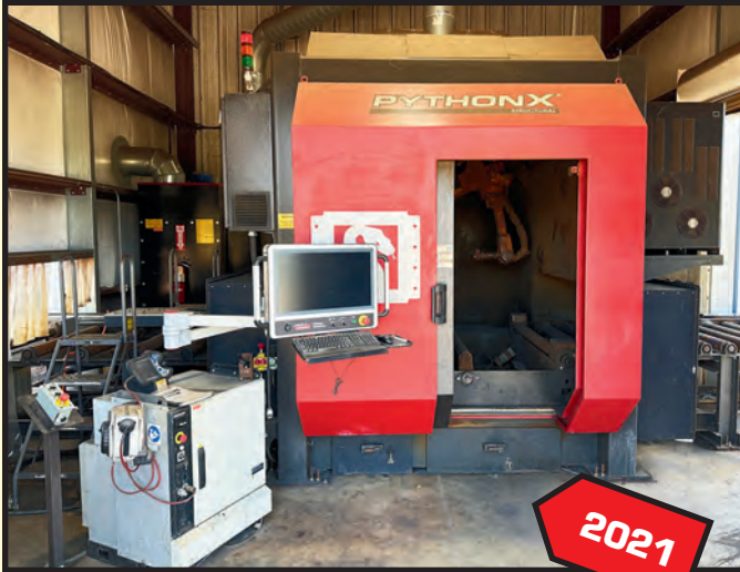
LINCOLN ELECTRIC ROBOTIC PLASMA CUTTING SYSTEM

Featuring: 2021 Lincoln Electric "PythonX" Structural Robotic Plasma Cutting System; 2023 Controlled Automation PlasMAX 10' x 25' Plasma Cutting System; Controlled Automation Beam & Angle Lines; Cambering Machine; Bandsaws; Drills; Pipe Bender; Welders; Air Compressors; Shop Support Equip.; (5) Late Model Hyundai & Komatsu Forklifts Up to 35,000-Lb. Cap.; Trucks; Trailers; Office Furniture & Equip.; More!