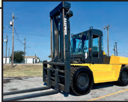
KOMATSU 30,000-LB. BASE CAP. DIESEL FORKLIFT