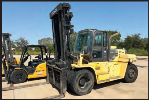
HYUNDAI 35,000-LB. BASE CAP. DIESEL FORKLIFT

UTILITY TANDEM AXLE , 18', wood deck, metal sides, electric breaks.