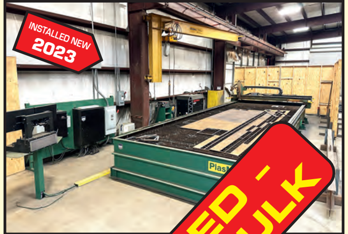
CONTROLLED AUTOMATION PLASMAX PLA