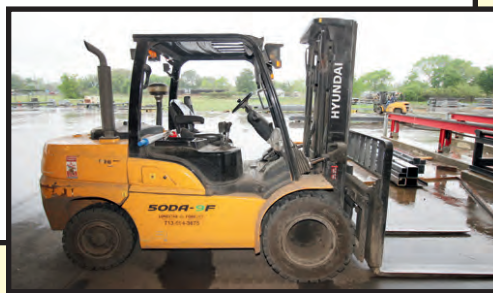
(1 OF 2) HYUNDAI 11,000-LB. BASE CAP. DIESEL FORKLIFTS