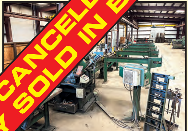
CONTROLLED AUTOMATION MDL. ANGLE LINE RETRO ANGLE LINE