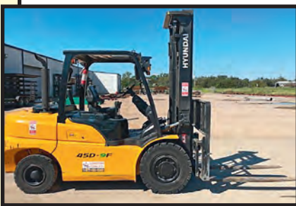
HYUNDAI 8,000-LB. BASE CAP. DIESEL FORKLIFT

KIP MDL. 7170 36" 2-ROLL MONO WIDE LARGE FORMAT INKJET COPIER PRINTER SCANNER; BIG SCREEN TVS; CONFERENCE TABLE W/EXECUTIVE TYPE GUEST CHAIRS; RICOH COPIER; LUNCHROOM APPLIANCES; DESKS, CHAIRS, FILING CABINETS, MORE.