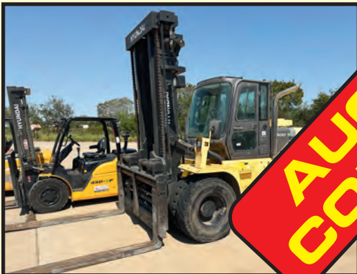
HYUNDAI 35,000-LB. BASE CAP. DIESEL FORKLIFT

Read Partial Terms and Conditions on Page 4