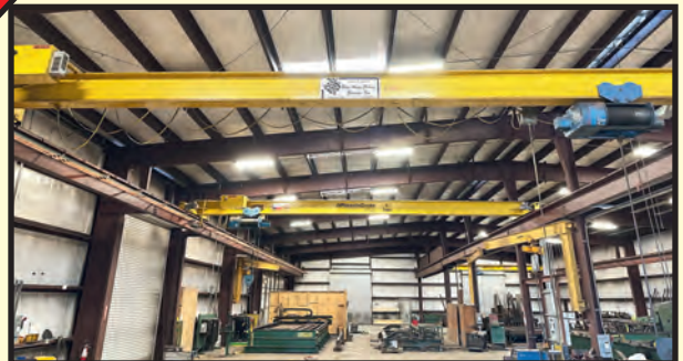
PROSERV OVERHEAD BRIDGE AND GORBELT COLUMN MOUNTED JIB CRANES

Read Partial Terms and Conditions on Page 4