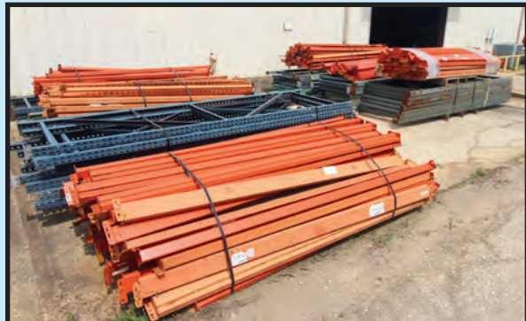
ADJUSTABLE PALLET RACKING