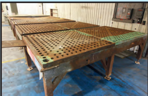
SAMPLE VIEW OF WELDING ACORN TABLES

WEDNESDAY, JUNE 19 • 10:00 A.M. LIVE ONSITE W/WEBCAST