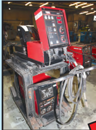
LINCOLN S350 POWERWAVE WELDING MACHINE