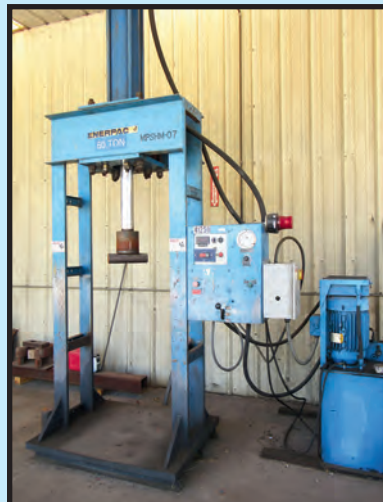
ENERPAC 50 T. HYDRAULIC PRESS