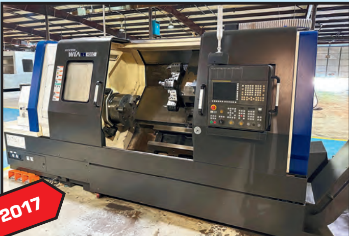
HYUNDAI WIA L400C CNC LATHE

FASTLANE MACHINE & FABRICATION 10906 FM 2920, TOMBALL, TEXAS 77375