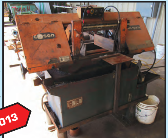
COSEN MDL. MH-1016JA HORIZONTAL BANDSAW