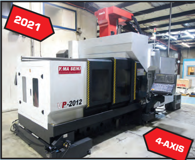
YAMA SEIKI MDL. VP-2012 4-AXIS BRIDGE TYPE MACHINING CENTER