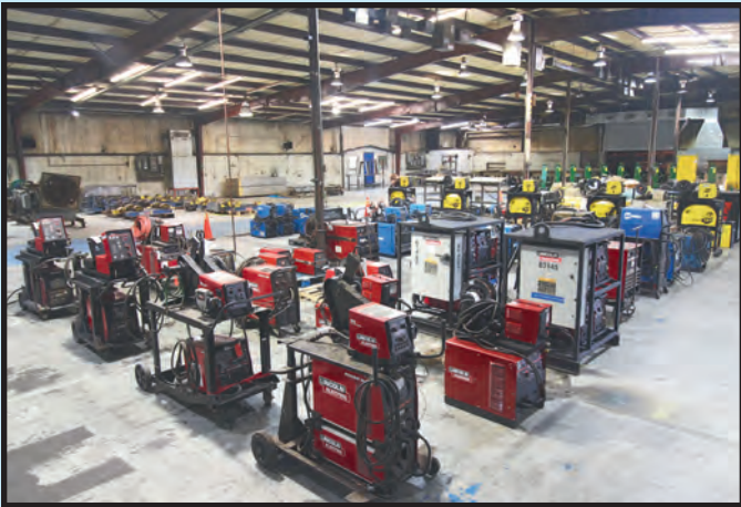
SAMPLE VIEW OF WELDING MACHINES