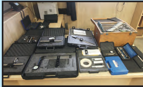
SAMPLE VIEW OF QC EQUIPMENT

BROWN & SHARPE TESA MICRO HITE 6 DIGITAL HEIGHT GAGE