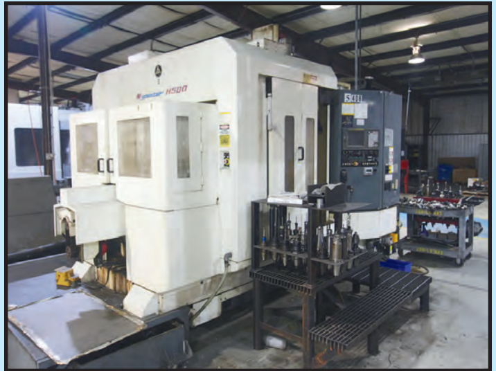
KITAMURA MDL. MYCENTER-H500 CNC HORIZONTAL MACHINING CENTER