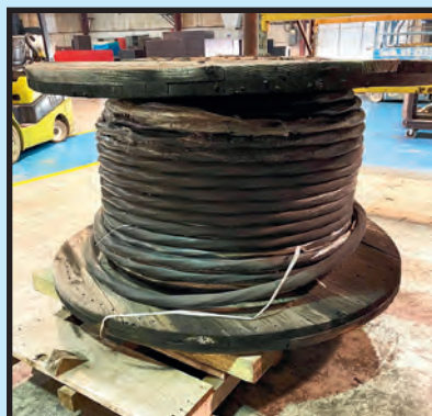
SPOOL OF HEAVY DUTY COOPER WIRE