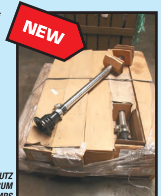
NEW LUTZ DRUM PUMPS