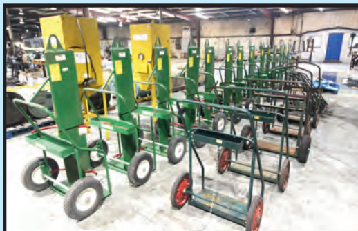
SAMPLE VIEW OF BOTTLE CARTS