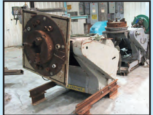
RANSOME WELDING POSITIONERS

HYPERTHERM PLASMA HPR 260 XD, 260 amp., S/N 260-006216; THERMAL DYNAMICS CUT-MASTER 101 AND CUTMASTER 52; MILLER SPECTRUM 375 X-TREME.