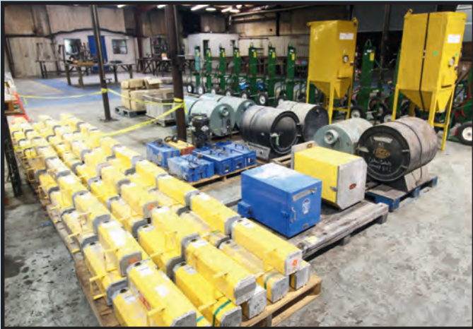
SAMPLE VIEW OF ROD OVENS

FOR BIDDING AT THIS AUCTION. Go to www.pmi-auction.com and click on BidSpotter on our calendar page for this auction sale.