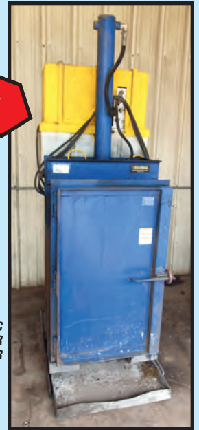
VESTIL HYDRAULIC DRUM CRUSHER AND COMPACTOR