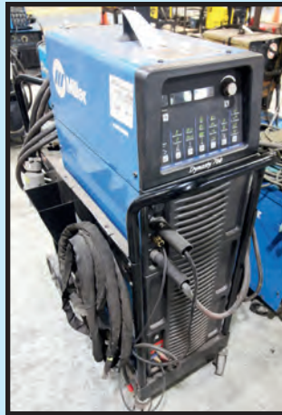
MILLER DYNASTY 700 WELDING MACHINE

FASTLANE MACHINE & FABRICATION 10906 FM 2920, TOMBALL, TEXAS 77375