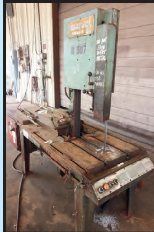
MARVEL SERIES 8 MARK I VERTICAL BANDSAW