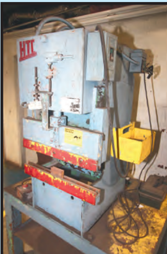
HTC MDL. MB-2 MNIII PRESSBRAKE