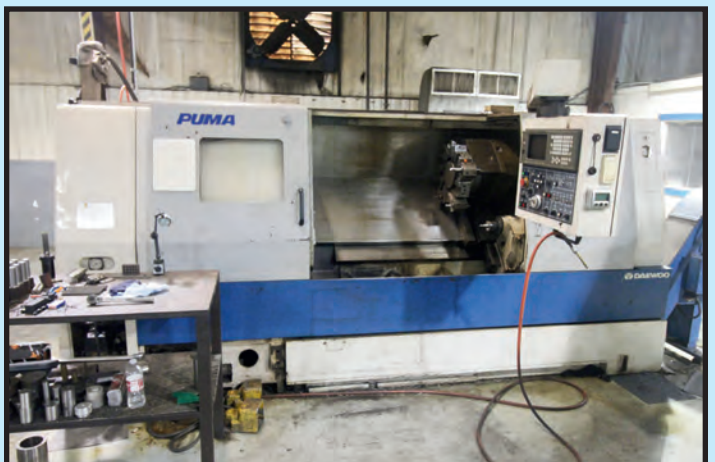
DAEWOO PUMA MDL. 25LB CNC LATHE