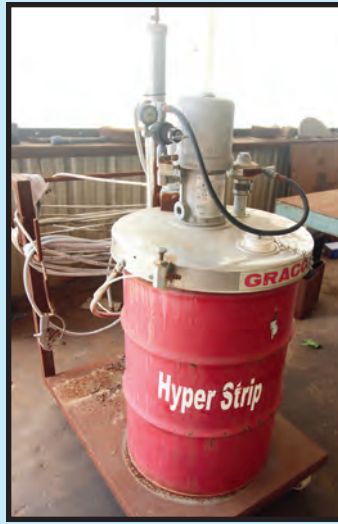
GRAYCO SPRAY SYSTEM