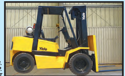
YALE 8,000- LB. BASE CAP. LPG FORKLIFT