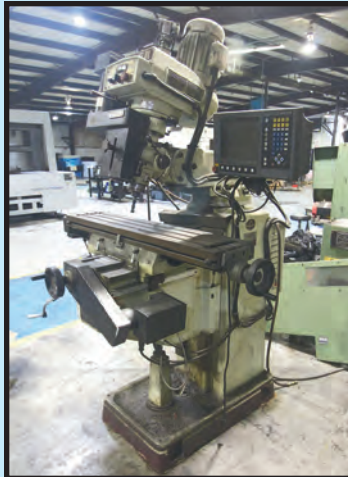
ACER MDL. FVS-3VKH CNC BED MILL

KURT VISES; CAT 40 AND CAT 50 TOOLING; 3-JAW AND 4-JAW CHUCKS; TOMBSTONES; SET-UP TOOLING.