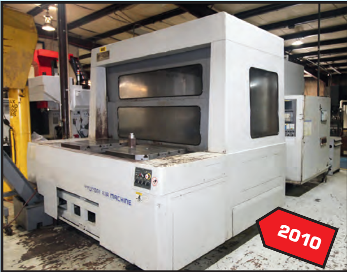
HYUNDAI KIA MDL. KH80G CNC HORIZONTAL MACHINING CENTER