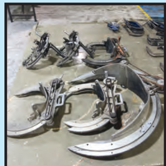
SAMPLE VIEW OF PIPE BEVELING MACHINES