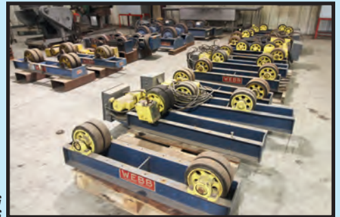
WEBB TANK TURNING ROLL SETS