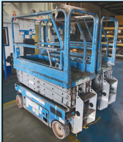
(2) GENIE MDL. GS1930 SCISSOR LIFTS