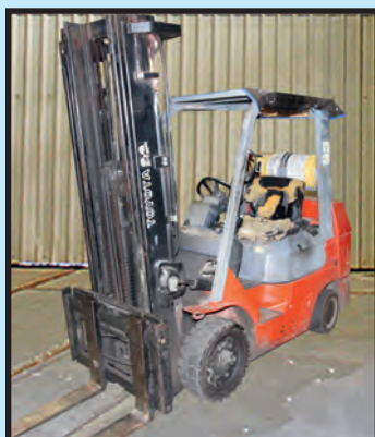
TOYOTA-5,000-LB. BASE CAP. LPG FORKLIFT

1 T. ABELL-HOWE W/YALE 1 T. ELECTRIC HOIST; 1 T. GORBEL W/1 T. COFFING HOIST; 1 T. W/ CM ELECTRIC HOIST; FORKLIFT BOOM; (2) FORKLIFT MAN BASKETS.