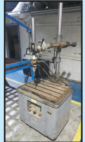
ELECTRO-ARC MDL. 2DB TAP DISINTEGRATOR