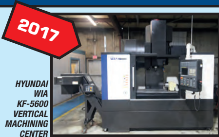
HYUNDAI WIA KF-5600 VERTICAL MACHINING CENTER

Presorted First Class Mail U.S. Postage PAID Eugene, Oregon Permit No. 17