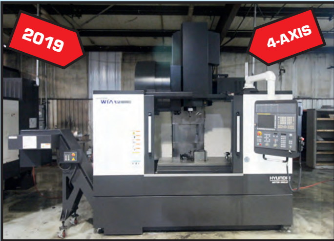
HYUNDAI WIA MDL. KF-5600C 4-AXIS VERTICAL MACHINING CENTER

DAEWOO PUMA 8 , Fanuc Series OT control, 14.6" max. turning dia., 20.7" max. turning length, 6" 3-jaw chuck, 10-pos. turret, (needs repair).