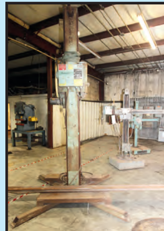
ARONSON WELDING MANIPULATOR