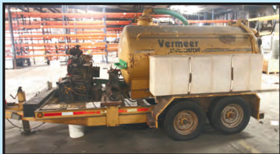
VERMEER EVACUATOR VACUUM TRAILER