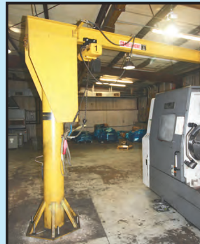
ABELL-HOWE 1 T. PEDESTAL JIB CRANE