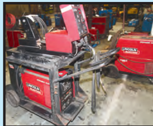
LINCOLN S350 POWERWAVE WELDING MACHINE