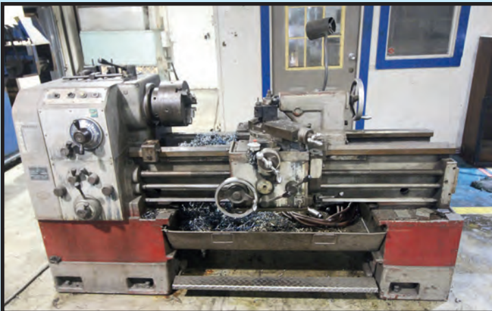
HOWA SANGYO 17" X 40" ENGINE LATHE

FOR BIDDING AT THIS AUCTION. Go to www.pmi-auction.com and click on BidSpotter on our calendar page for this auction sale.