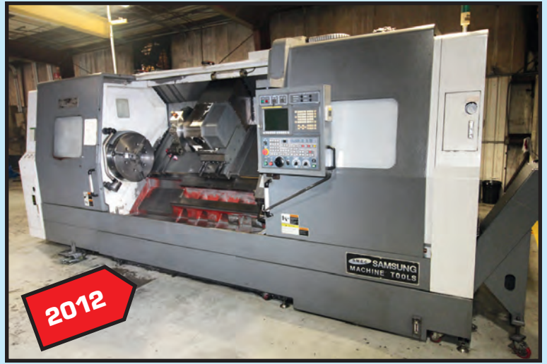
SAMSUNG SL45/2200BB CNC LATHE