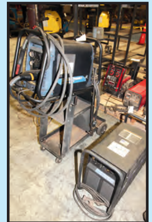
THERMAL DYNAMICS PLASMA CUTTERS

INSPECTION: Monday & Tuesday, June 17 & 18, 9:00 A.M. to 4:00 P.M. Each Day