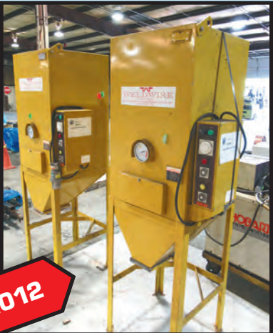
WELD WIRE WELDING ROD OVENS