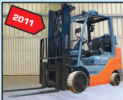
TOYOTA 10,000-LB. BASE CAP. LPG FORKLIFT