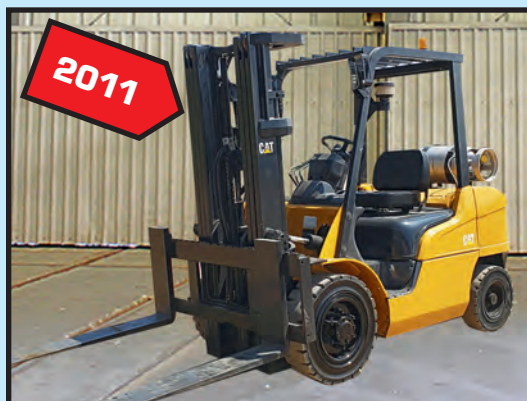
CATERPILLAR 6,000-LB. BASE CAP. LPG FORKLIFT