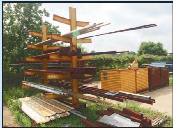
SAMPLE VIEW OF RAW MATERIALS

DESKS; CHAIRS; SHARP MX-2610N COPIER; (3) SHARP MX-311N COPIERS.