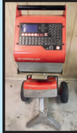
SIC E9D MARKING MACHINE

BROWN & SHARPE TESA MICRO HITE 6 DIGITAL HEIGHT GAGE