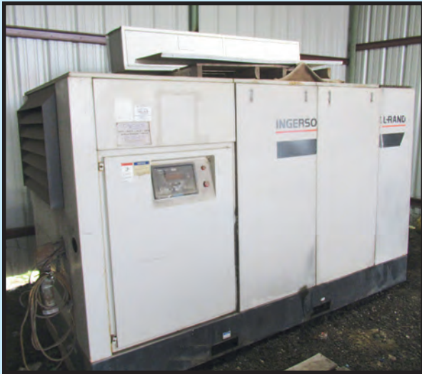
INGERSOLL RAND 150 HP ROTARY SCREW AIR COMPRESSOR