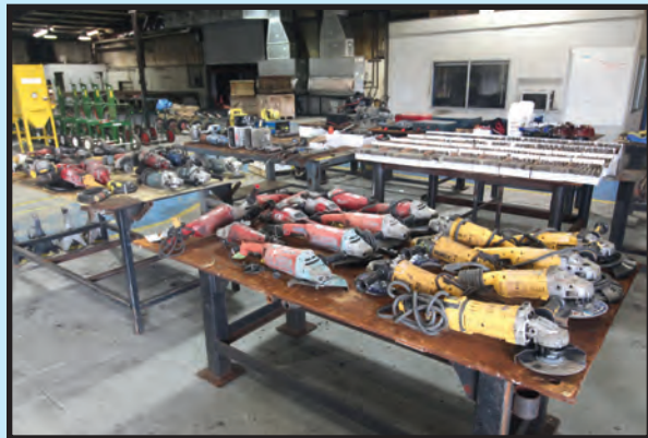
SAMPLE VIEW OF POWER AND HAND TOOLS

WEDNESDAY, JUNE 19 • 10:00 A.M. LIVE ONSITE W/WEBCAST