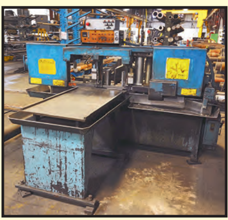
HEM H-120LA AUTOMATIC HORIZONTAL BANDSAW

FOR ONLINE BIDDING AT THIS AUCTION. Go to www.pmi-auction.com and click on BidSi@ter.com or proxibid on our calendar page for this auction sale.