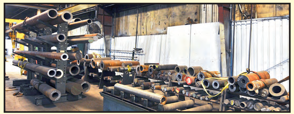
SEAMLESS STEEL TUBING MATERIAL