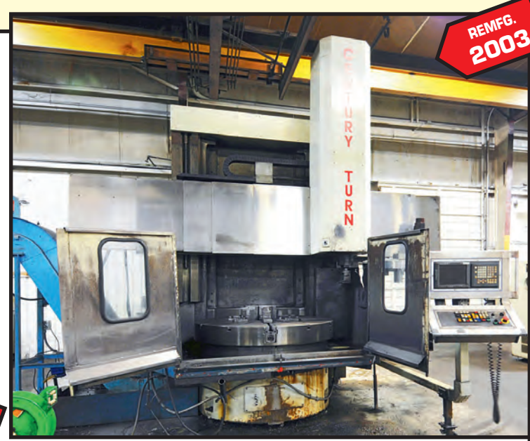
NEW CENTURY 60" CNC VERTICAL BORING MILL