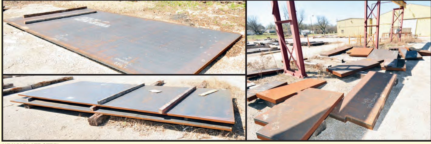
HEAVY PLATE STEEL

HEAVY PLATE STEEL HUGE ASSORTMENT OF HEAVY PLATE STEEL UP TO 7" THICK, complete plates up to 8' x 20' x 2" sizes.