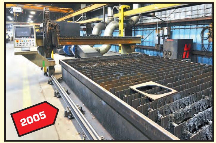
ALLTRA CNC PLASMA SHAPE CUTTING MACHINE