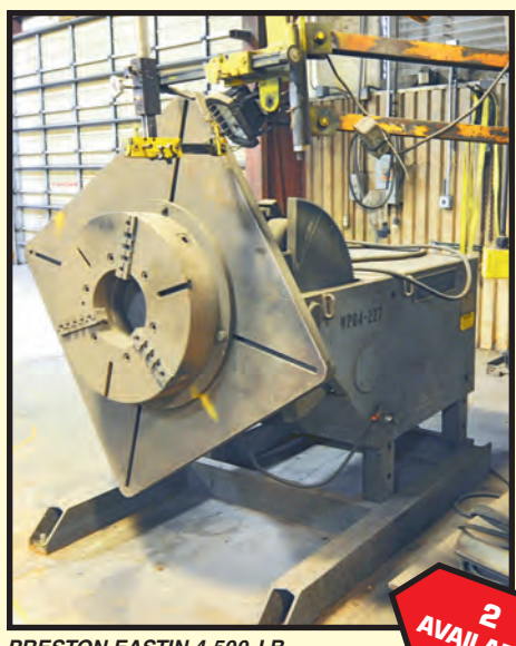
PRESTON EASTIN 4,500-LB. WELDING POSITIONER