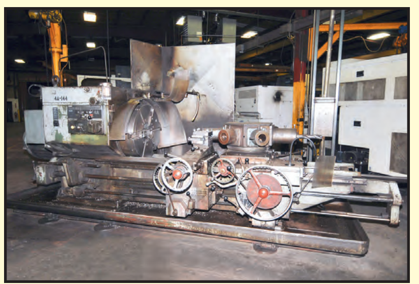
WARNER & SWASEY 4A SADDLE TYPE TURRET LATHE

KING 72 ", 72" built-in faceplate, (4) top jaws, approx. 82" swing, L.H. swivel ram head, R.H. turret head, side head w/hyd. tracer attach., rewired pendant, 50 HP tbl. drive motor, 3-axis D.R.O.