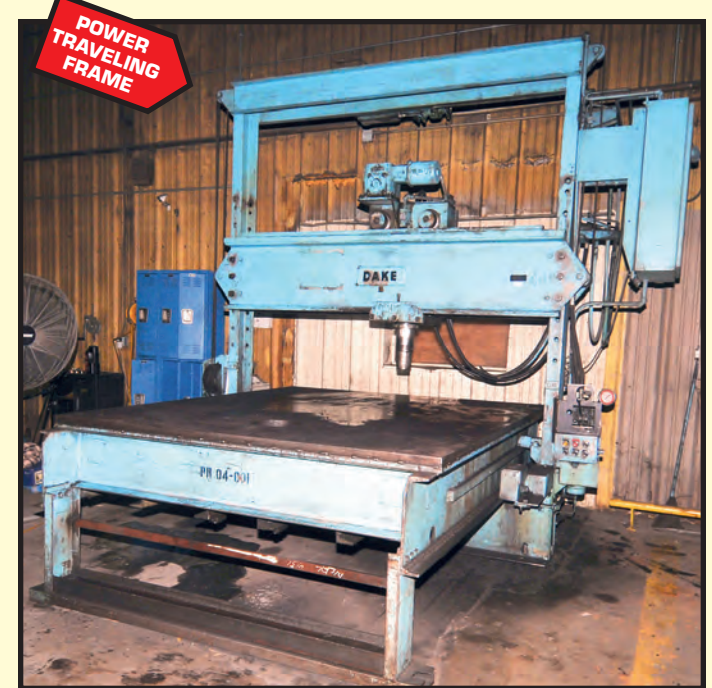
DAKE 175 T. PLATE STRAIGHTENING PRESS

ALLTRA 10' X 20' MDL. PG-14-10, new 2006, Burny 10 LCD Plus CNC control, single plasma cutting head, aux. oxy. fuel cutting head w/electric torch elevation, down-draft tbl., S/N 5231 (*Note: The Hypertherm Plasma Power Supply to this machine is not included).