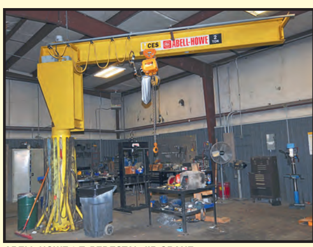
ABELL-HOWE 2 T. PEDESTAL JIB CRANE