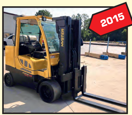
HYSTER 12,000-LB. BASE CAP. FORKLIFT