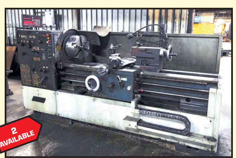
ROMI 20" X 60" ENGINE LATHE

HUGE QUANTITY OF RAW MATERIAL – SEE PAGE 7