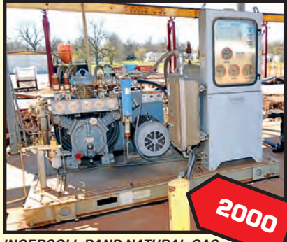
INGERSOLL RAND NATURAL GAS COMPRESSOR SYSTEM