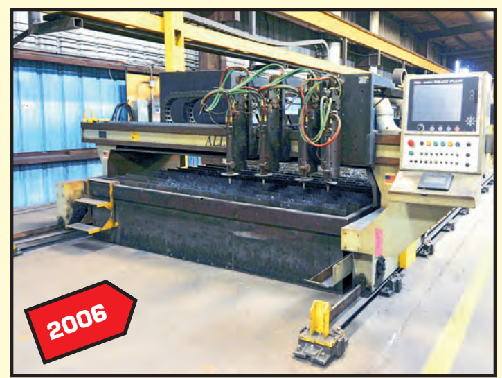
ALLTRA 4-HEAD CNC OXY. FUEL SHAPE CUTTING MACHINE