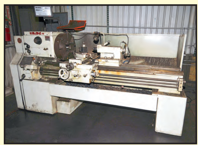
LEBLOND REGAL 17" X 60" ENGINE LATHE