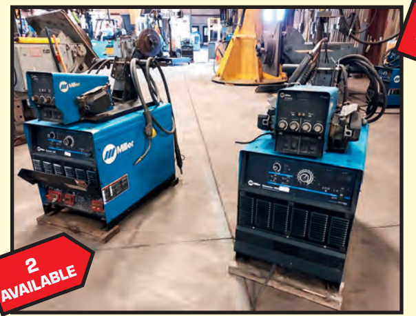
MILLER DIMENSION 1000 MIG WELDERS

(2) MILLER MDL. DIMENSION 452 DUAL WIRE, 450 amps @ 38 v., 100% duty cycle, Miller 70 Series dual wire feeder, on portable cart, S/N KJ119986, KG141471.