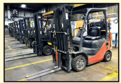
TOYOTA CNG 5,000-LB. BASE CAP. FORKLIFT