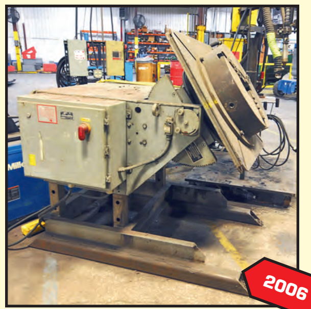
KOIKE ARONSON 4,500-LB. WELDING POSITIONER