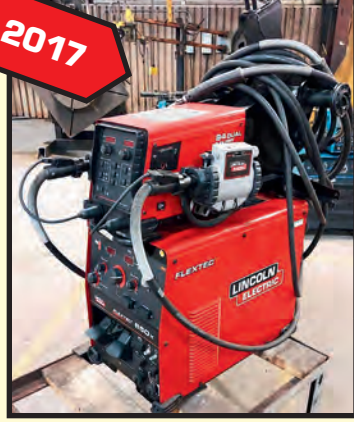
LINCOLN FLEXTEC 650 INVERTER DUAL WIRE MIG WELDER