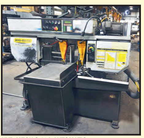
HYD-MECH S-20A AUTOMATIC HORIZONTAL BANDSAW