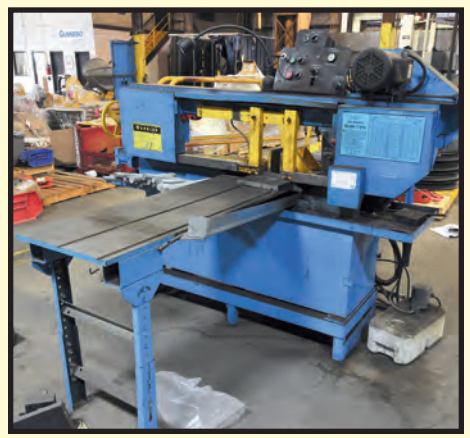
DOALL C-16 SEMI-AUTOMATIC HORIZONTAL BANDSAW

FOR ONLINE BIDDING AT THIS AUCTION. Go to www.pmi-auction.com and click on BidSi@ter.com or proxibid on our calendar page for this auction sale.