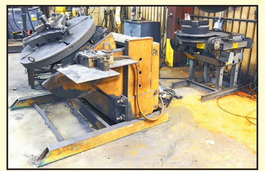
RANSOME 4,000-LB. AND KOIKE ARONSON 2,000-LB. WELDING POSITIONERS