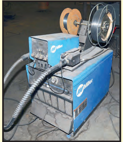
MILLER DIMENSION 652 DUAL WIRE MIG WELDER