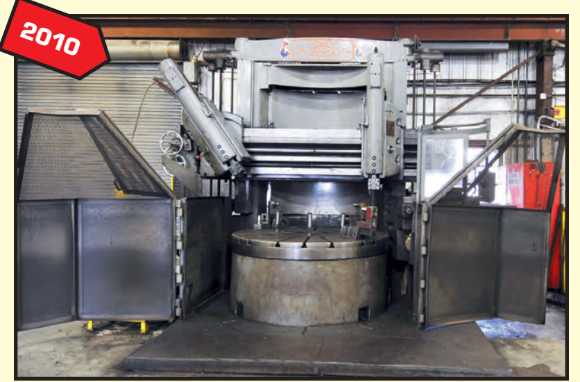
BULLARD 74" CUTMASTER VERTICAL BORING MILL