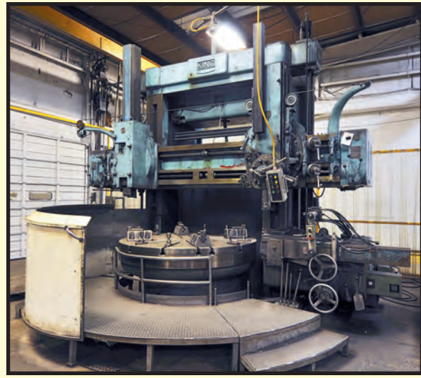
KING 72" VERTICAL BORING MILL