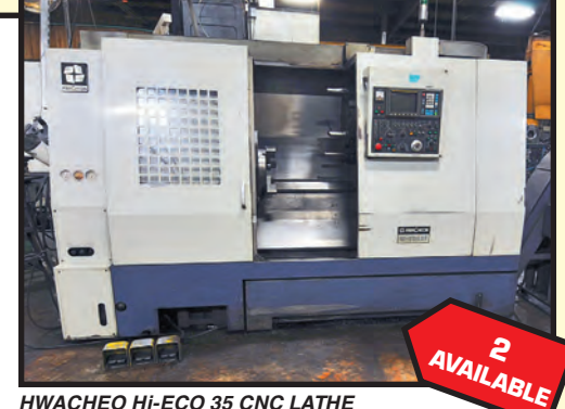
HWACHEO Hi-ECO 35 CNC LATHE