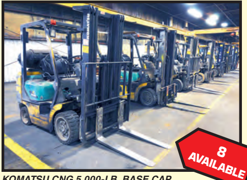
KOMATSU CNG 5,000-LB. BASE CAP. FORKLIFTS