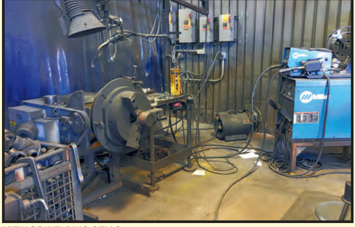
VIEW OF WELDING CELLS

Live Onsite w/Webcast – At the Premises of GUNNEBO INDUSTRIES 1240 NORTH HARVARD AVENUE TULSA, OKLAHOMA 74115