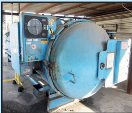
HERCULES INDUSTRIES MDL. 1523C AUTOCLAVE

U.S. Bankruptcy Case #20-34466 of CUSTOM RUBBER PRODUCTS, LLC 2625 BENNINGTON STREET, HOUSTON, TEXAS 77093 TUESDAY, DECEMBER 8 • 10:00 A.M. LIVE ONLINE WEBCAST (NO ONSITE BIDDING)