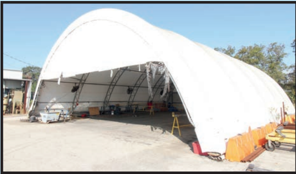
TRUSS STYLE PORTABLE CANVAS COVERED BUILDING