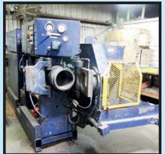
BARWELL TYPE C3GP RUBBER EXTRUDER PRECISION PREFORMER