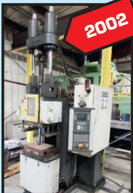
DESMA MDL. D956.050 VERTICAL RUBBER INJECTION PRESS