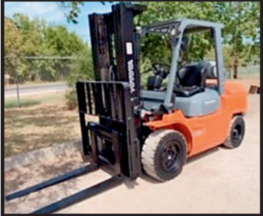
SAMPLE VIEW OF LATE MODEL FORKLIFTS