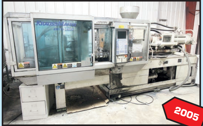
KRAUSS MAFFEI 175 T. MDL. 175-1400 C2 INJECTION MOLDING MACHINE