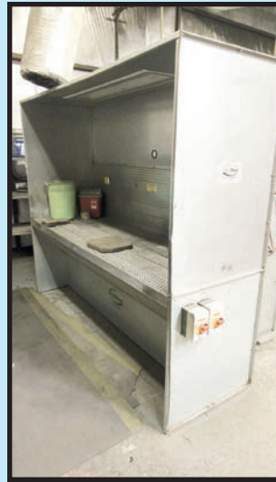
(1 OF 5) DUAL DRAW 30" X 96" DOWNDRAFT TABLES

TUESDAY, DECEMBER 8 LIVE ONLINE WEBCAST (NO ONSITE BIDDING)