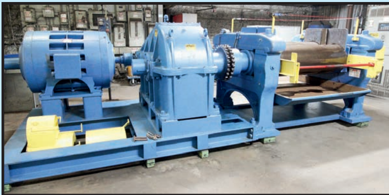
STEWART BOLLING & CO. 150 HP RUBBER MILL