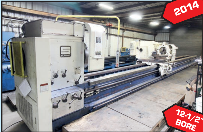
SUMMIT 47" X 480" LARGE CAPACITY HOLLOW SPINDLE LATHE