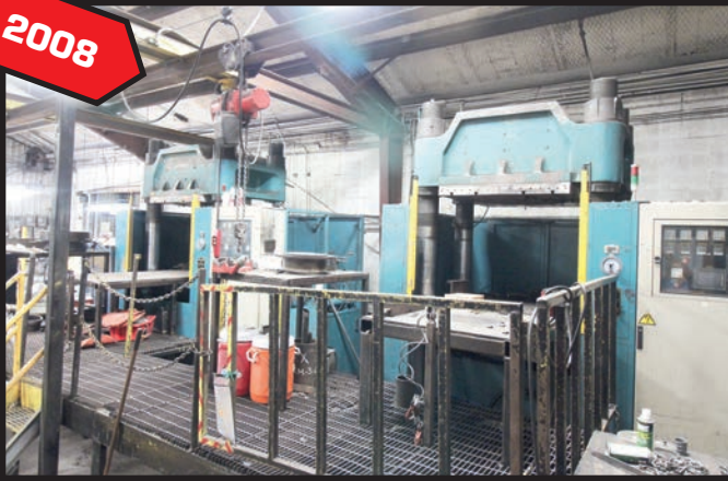
(2) TUNG-YU 950 T. CAP. COMPRESSION MOLDING PRESSES