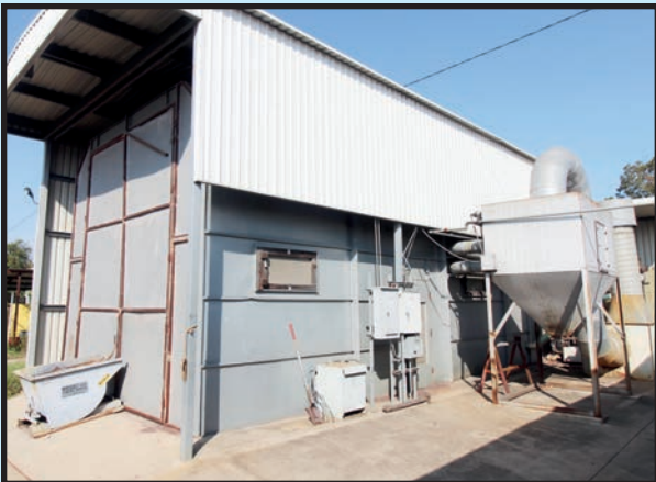
APPROX. 15'W. X 40'L. BLAST BOOTH