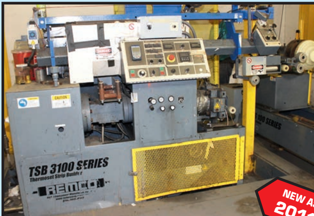
CLOSE UP VIEW OF (1 OF 5) REMCO MDL. TSBS3100 THERMOSET STRIP BUILDERS

Featuring: (5) Remco Thermoset Strip Builders; Summit 47" x 480" 12" Bore Hollow Spindle Lathe; (2) Stewart Bolling Rubber Mills; Mold Presses up to 950 T.; (4) Autoclaves; Frac Ball Molds & Ball Grinders; Summit CNC Flat Bed Lathe; (7) Other Engine Lathes up to 30" x 200"; Plastic Injection Molder; Wheelabrators; Steel Pipe; Pipe Blaster; Q.C. Equip.; Forklifts; Vehicles; Sea Containers; Crane Systems; Offices; More!