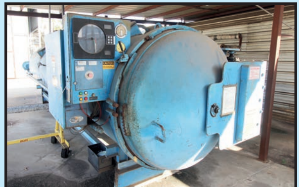
HERCULES INDUSTRIES MDL. 1523C AUTOCLAVE