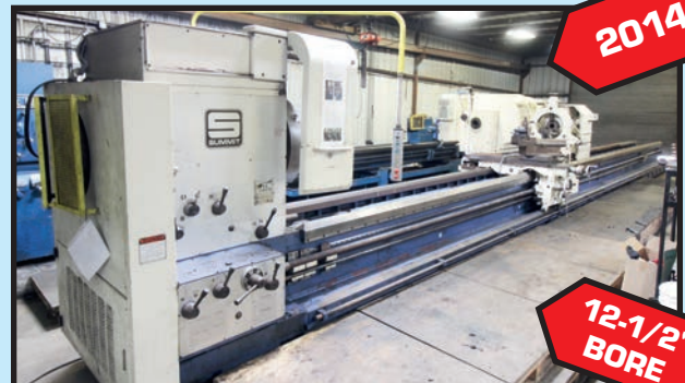
SUMMIT 47" X 480" LARGE CAPACITY HOLLOW SPINDLE LATHE