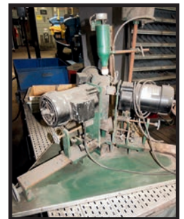
BALL SHAPER W/3-HEAD DESIGN

BALL MOLDS: (11) Large Molds from 1-3/4"-2-3/4" dual cavity; (13) Small Molds from 3/4"-1-3/4"; PLUS VERTISPHERE MDL. 16/24 BALL GRINDER, variable spd. control, 0-100 FPM w/several grinding plates; BALL SHAPER w/3-head design, 1/5 HP per head, custom.