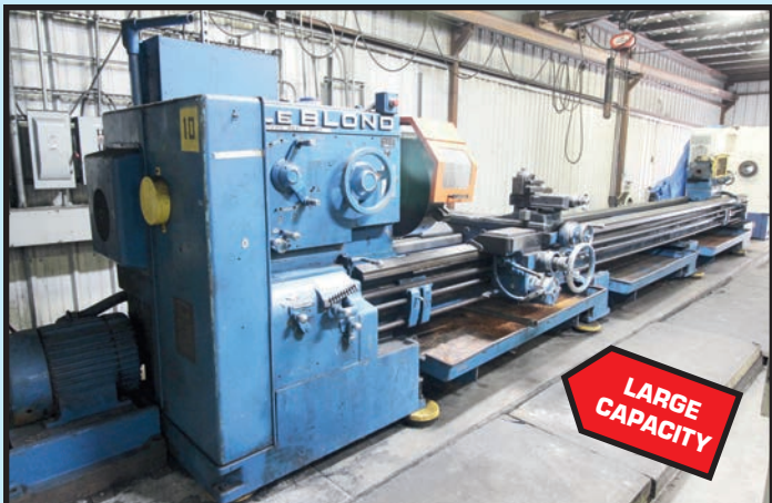
LEBLOND 32" X 264" MDL. 3220 H.D. ENGINE LATHE