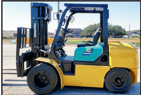
KOMATSU 8,000-LB. BASE CAP. DIESEL FORKLIFT