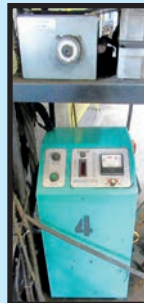
(1 OF 3) PROSCO ROLLER GROOVING TYPE ELASTOMER CUTTING SYSTEMS