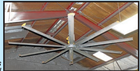
BIG ASS FAN