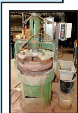
VERTISPHERE MDL. 16/24 BALL GRINDER