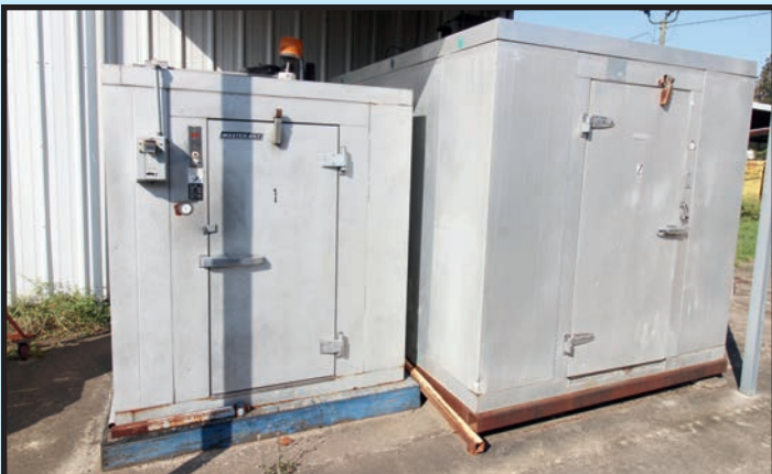
PENN & MASTERBUILT WALK-IN REFRIGERATORS