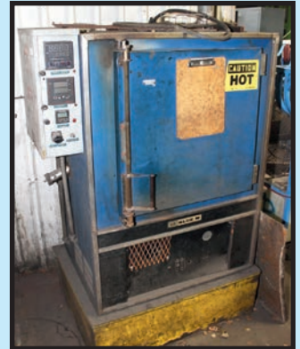
(1 OF 3) BLUE M OVENS

TUESDAY, DECEMBER 8 LIVE ONLINE WEBCAST (NO ONSITE BIDDING)