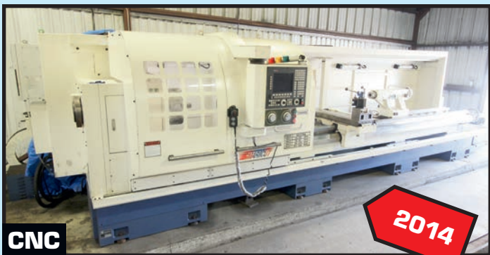
SUMMIT SMARTCUT 30 MDL. SC30-6X200M CNC FLATBED LATHE