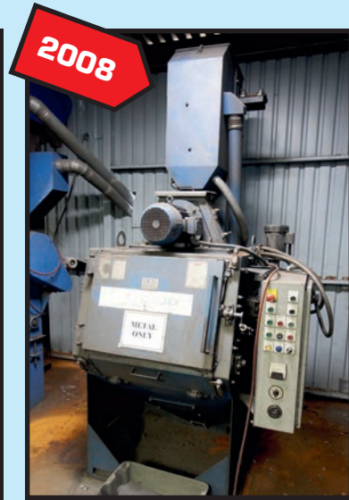
WHEELABRATOR MDL. SLT3.0 SMART LINE RUBBER BELT TUMBLEBLAST ABRASIVE BLAST SHOTBLASTING MACHINE