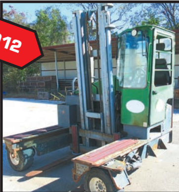
COMBILIFT 10,000-LB. BASE CAP. FORKLIFT