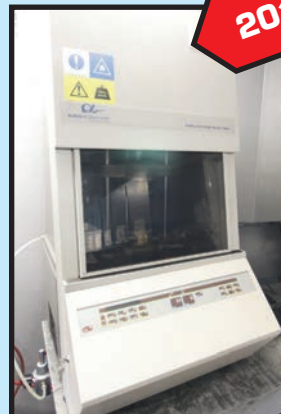
ALPHA TECHNOLOGIES MDL. MDR-2000 RHEOMETER