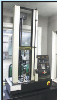
INSTRON MDL. 4411 TENSILE TESTER