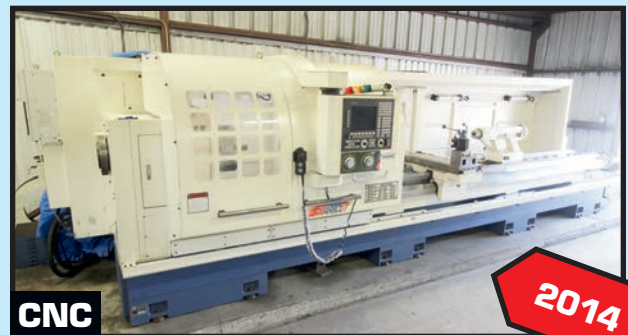
SUMMIT SMARTCUT 30 MDL. SC30-6X200M CNC FLATBED LATHE

Read Partial Terms & Conditions on Page 7