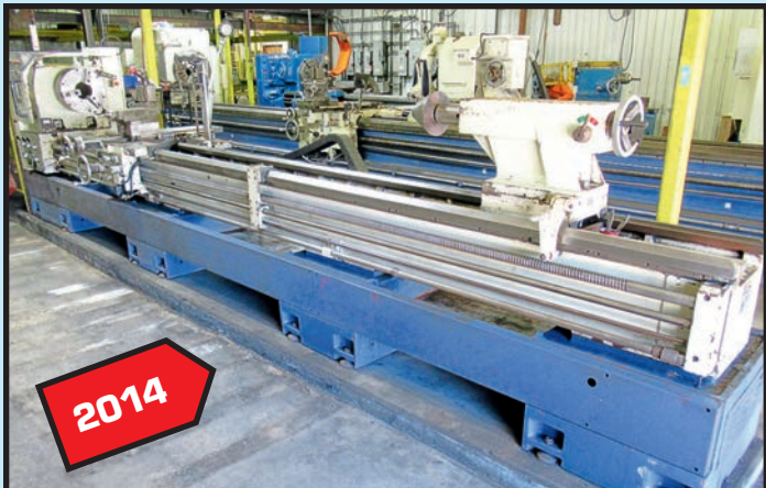
SUMMIT 30" X 200" GAP BED ENGINE LATHE