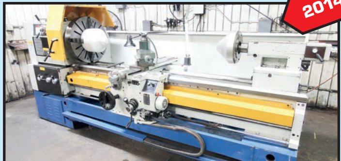
(1 OF 2) SUMMIT 24" X 60" GAB BED MDL. 24X60B ENGINE LATHES