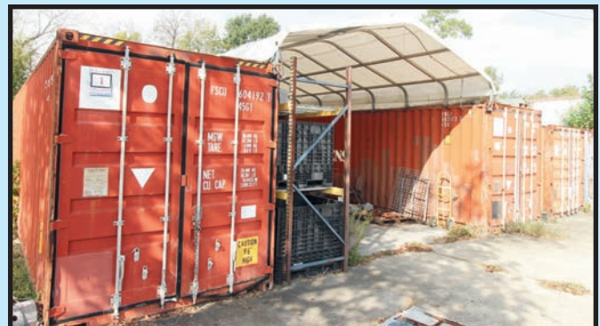
SAMPLE VIEW OF SHIPPING/STORAGE CONTAINERS

LIVE ONLINE BIDDING ONLY (NO ONSITE BIDDING): YOU MUST REGISTER IN ADVANCE FOR ONLINE BIDDING AT THIS AUCTION.