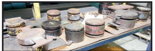
SAMPLE VIEW OF BALL MOLDS