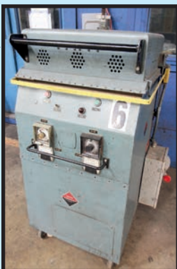
(1 OF 3) NEMETH RF PREHEATERS