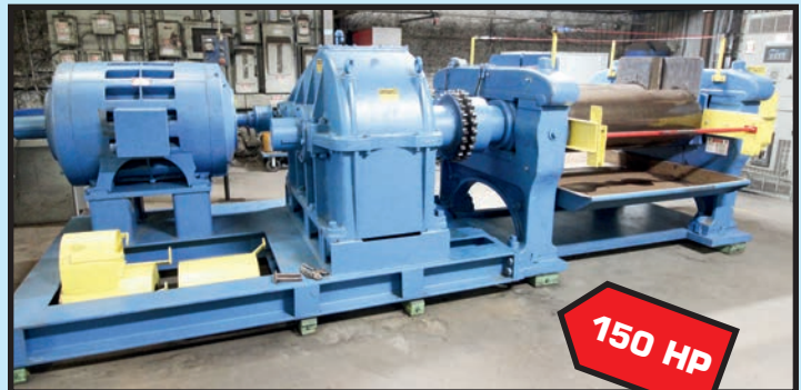
(1 OF 2) STEWART BOLLING & CO. RUBBER MILLS