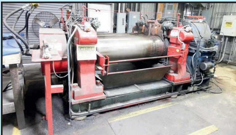
STEWART BOLLING & CO. 150 HP RUBBER MILL