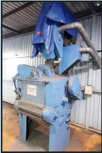
WHEELABRATOR RUBBER BELT TUMBLEBLAST ABRASIVE BLAST SHOTBLASTING MACHINE