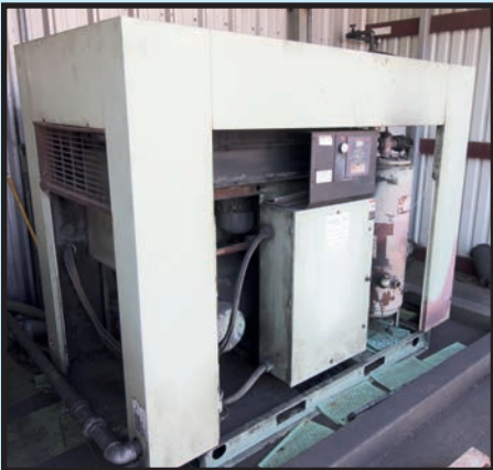
CURTIS MDL. RSD100 ROTARY SCREW AIR COMPRESSOR