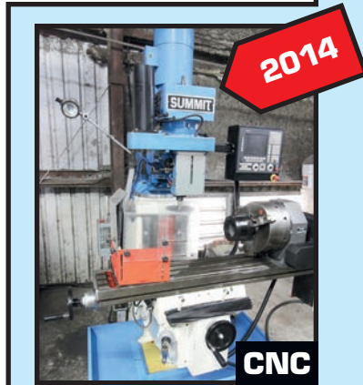
SUMMIT SMARTCUT MDL. EVS-350B-CNC VERTICAL MILL

SUMMIT SMART CUT MDL. EVS-350B-CNC , new 2014, Fagor CNC control, 10" x 58" tbl., Troyke Mdl. DL-12-B rotary tbl. w/12" dia. 3-jaw chuck, pwr. drawbar, Grizzly dual cartridge dust collection system, S/N 84.