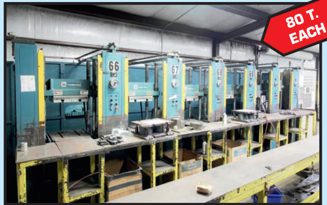
TUNG-YU MDL. TCY/8/6/S/PCD 6-CELL COMPRESSION MOLDING PRESS CELLS

(3) PROSCO MDL. 200 ROLLER GROOVING TYPE, w/electric heated cutter, s/n PRO-233J, PRO-245J, S/N N/A