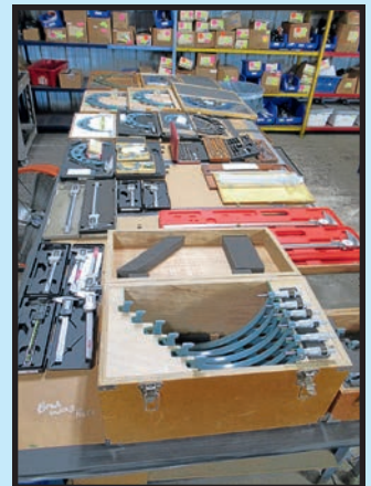
SAMPLE VIEW OF Q.C. EQUIPMENT

PRECISION QUINCY MDL. 40B-3500 , 48" x 26" x 48", 228 v., 74 full load amps, 0-400 deg. F. max. temp., S/N 23298; BLUE M , 21" x 21" x 18"; BLUE M , 36" x 24" x 48", S/N 04B33006W926009; DESPATCH , 36" x 60" x 36", S/N 9G0504T; BLUE M MDL. DV-18SA , S/N RPA-6554; ACE 240RT , 48" x 54" x 36" DP burn off type.