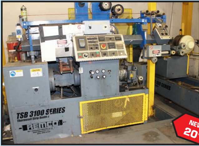
CLOSE UP VIEW OF (1 OF 5) REMCO MDL. TSB3100 THERMOSET STRIP BUILDERS